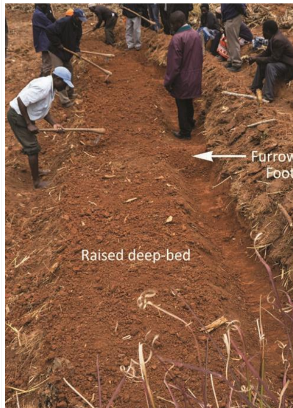
Figure 1, Constructing deep beds after contour

The technology includes construction of marker ridges, box ridges, use of manure, soil mulching, regenerative agriculture and planting vetiver grass on contoured marker ridges. These provided solutions to loss of soil, low soil fertility, sub-soil hard pans, low yields and loss of soil biodiversity. It accommodates soil mulching so it regulates soil temperature and reduces soil water evapotranspiration and soil surface run-off.